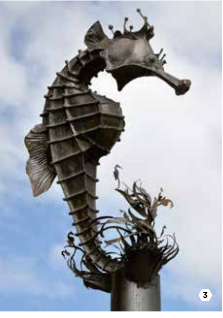
Filigree architecture in Battery Point The trademark fare of Taco Taco, a van that travels around Hobart This seahorse stands proud outside Mures Seafood restaurant on Hobart's waterfront